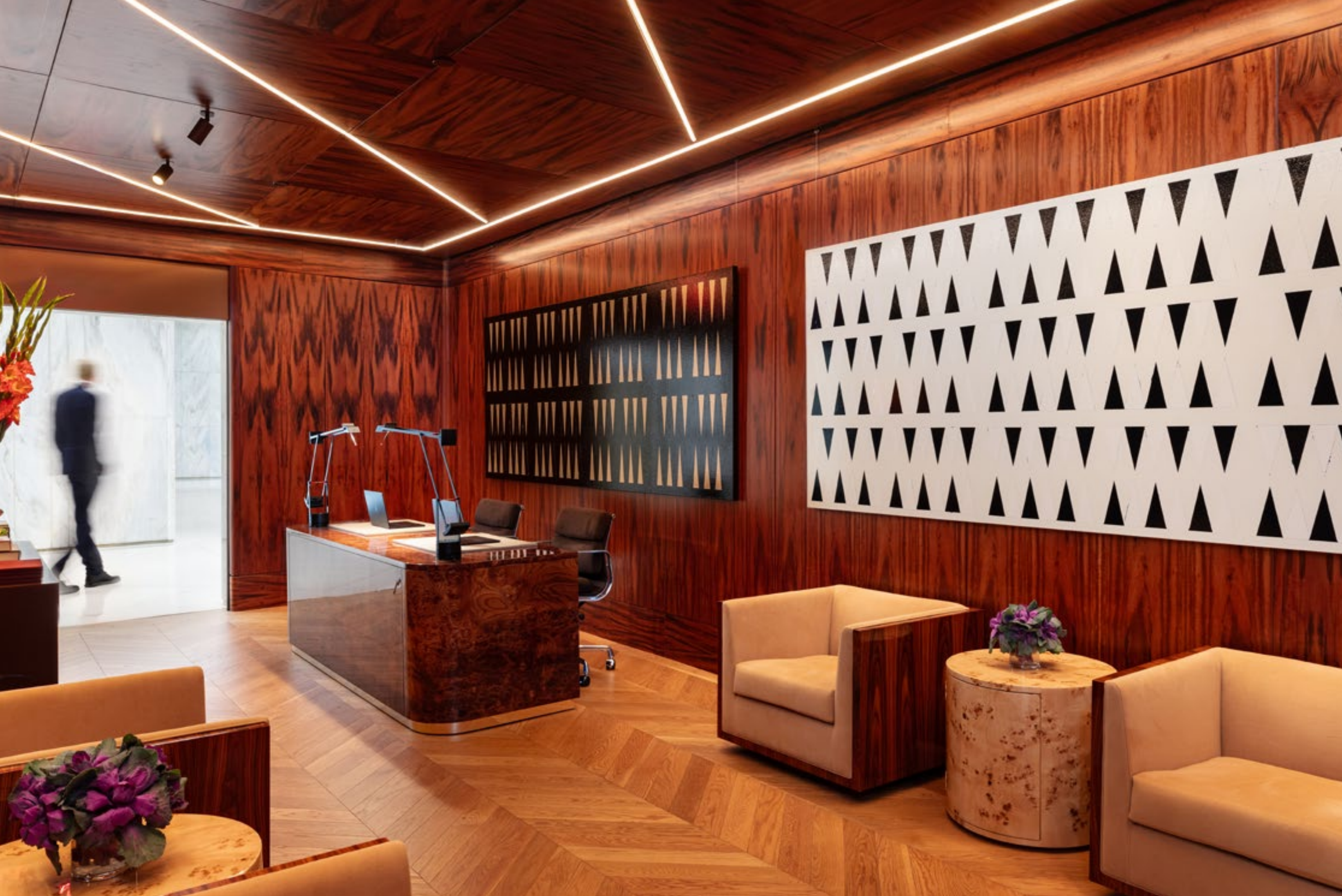
Private Ground Floor Lobby

“Colette is a first-of-its-kind, members-only club for the world’s most successful business leaders.”