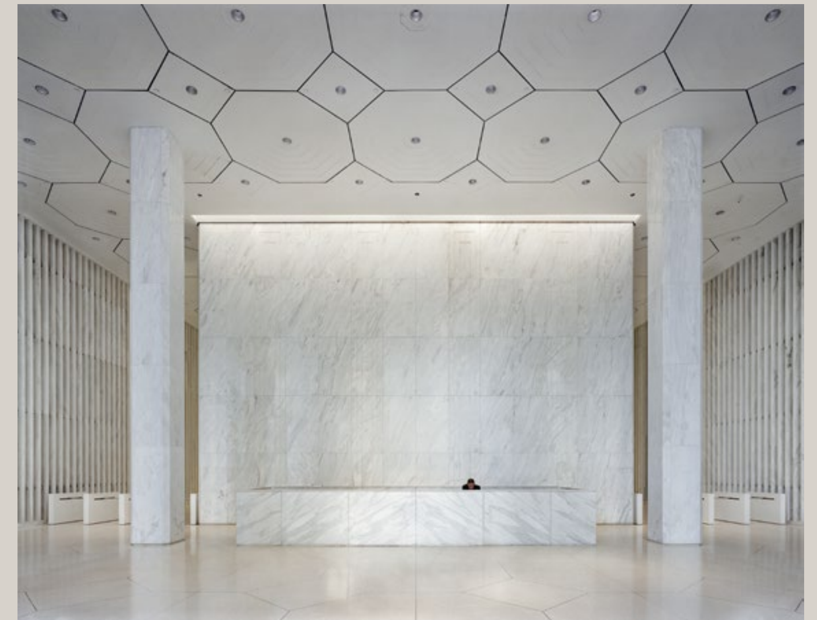
GM Building Lobby

One of Manhattan's most iconic structures, the 50-story GM Building occupies an entire city block on Fifth Avenue and 59th Street at the southeast corner of Central Park. Designed in the International Style by Edward Durell Stone & Associates with Emery Roth & Sons, it was completed in 1968 and has served as headquarters for global companies and business titans ever since. Housing New York's most sought-after office and retail spaces for over half a century and epitomizing the ever-evolving, forward-looking nature of business, there could be no better home for Colette.