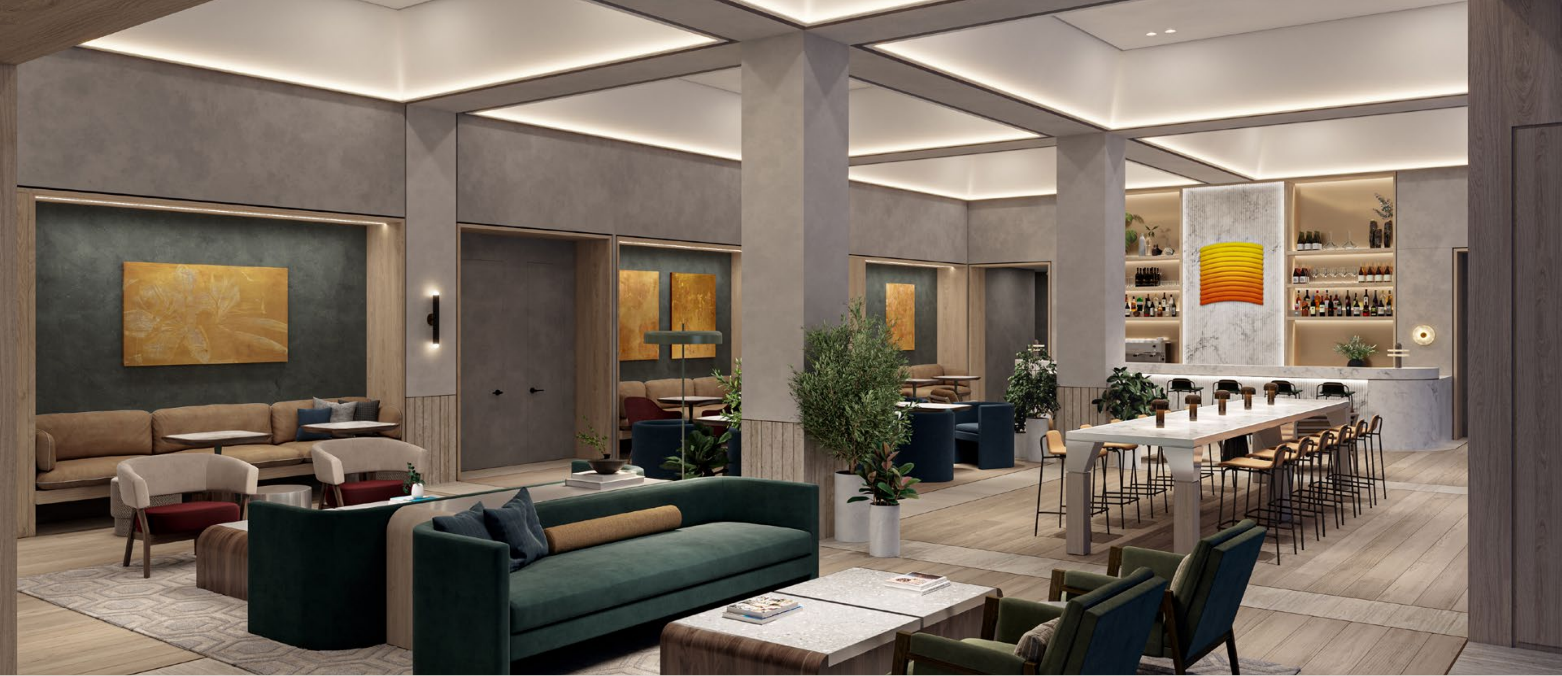
Newly built lounge for GM Building tenants.