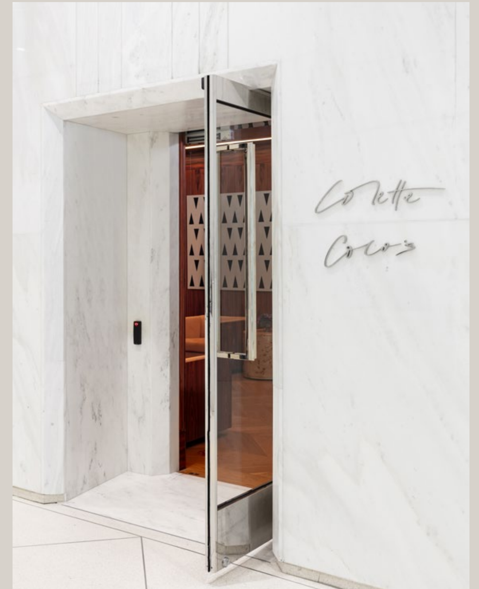
Private Lobby Entrance